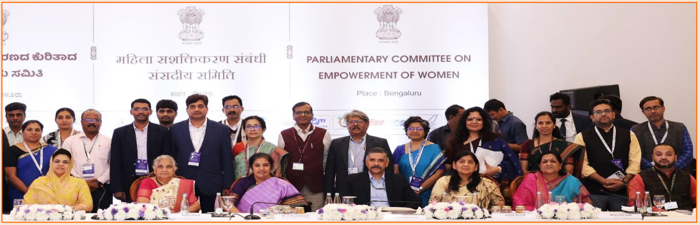
महिला सशक्तिकरण संबंधी संसदीय स्थायी समिति 2025-26 की अध्ययन यात्रा 26 से 30 दिसंबर, 2025 तक बेंगलुरु और तिरुवनंतपुरम में आयोजित की गई / Study Visit of the Parliamentary Standing Committee on the Empowerment of Women 2025-26 to Bengaluru and Thiruvananthapuram from December 26 to 30, 2025