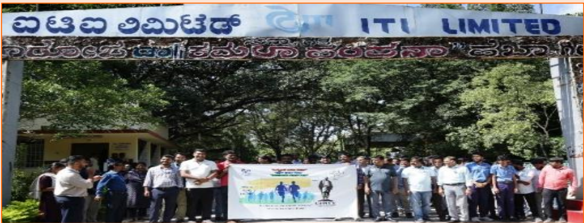
आईटीआई लिमिटेड ने राष्ट्रीय एकता दिवस 2026 मनाया / ITI Limited Observes National Unity Day 2026