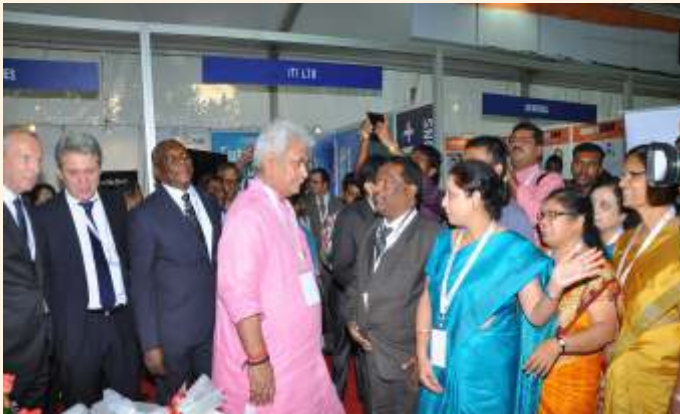
Shri Manoj Sinha, Hon'ble Minister of State for Communication & IT and delegates from BRICS Nations seen along with ITI Team

A two-day 2 nd BRICS Communications Ministers Meeting and Exhibition was hosted by Department of Telecommunications to discuss ways to improve collaboration in the field of digital economy, future communications, mobile technology at JW Marriott Hotel, Bengaluru on 10 th and 11 th November 2016. Shri Manoj Sinha, Hon'ble Minister of State for Communication & IT chaired the BRICS meeting.